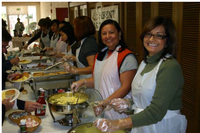
Our awesome Parent Volunteers!