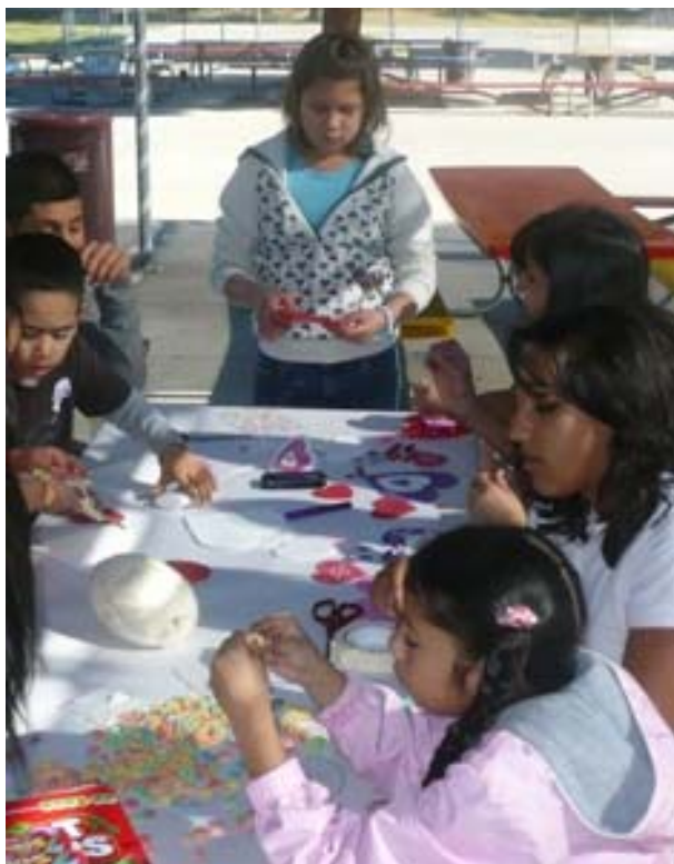
Alemany Amigos--Making Valentines