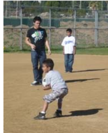
Alemany Amigos--Playing together