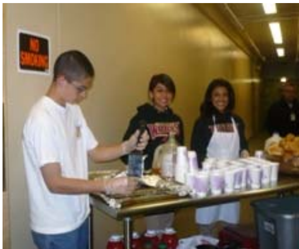
Sylmar Shelter meals Max-09 and Christian Leadership