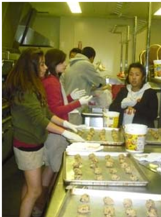
Making Dessert--The student-favorite part of preparing dinner for the SEWShelter; Brownies or Cookies--equally necessary to sample for quality!