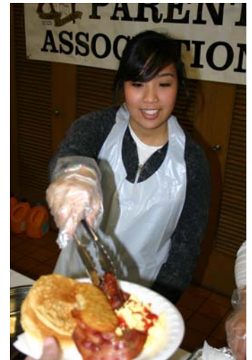
Parents and Students Serving our Community