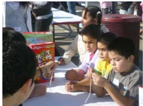
Alemany Amigos--Making these necklaces is the best! They are edible!