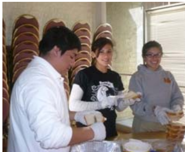
Only 144 more sandwiches to go! Sandwiches for Lunches for 150 guests at Sylmar Emergency Winter Shelter